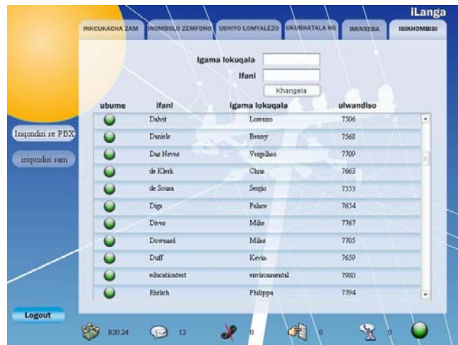
Figure 1. iLanga Main Page

using the translate@thon method. The initial phase took approximately six hours. The translations were later reviewed by a language expert before being integrated into the system (see Figure 1).