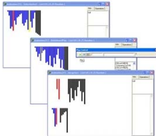
Figure 2: The play control managing an animation race

Since this prototype was developed as an instrument for an existing Data Structures module within the department there was no need to develop additional instructional material (R10).